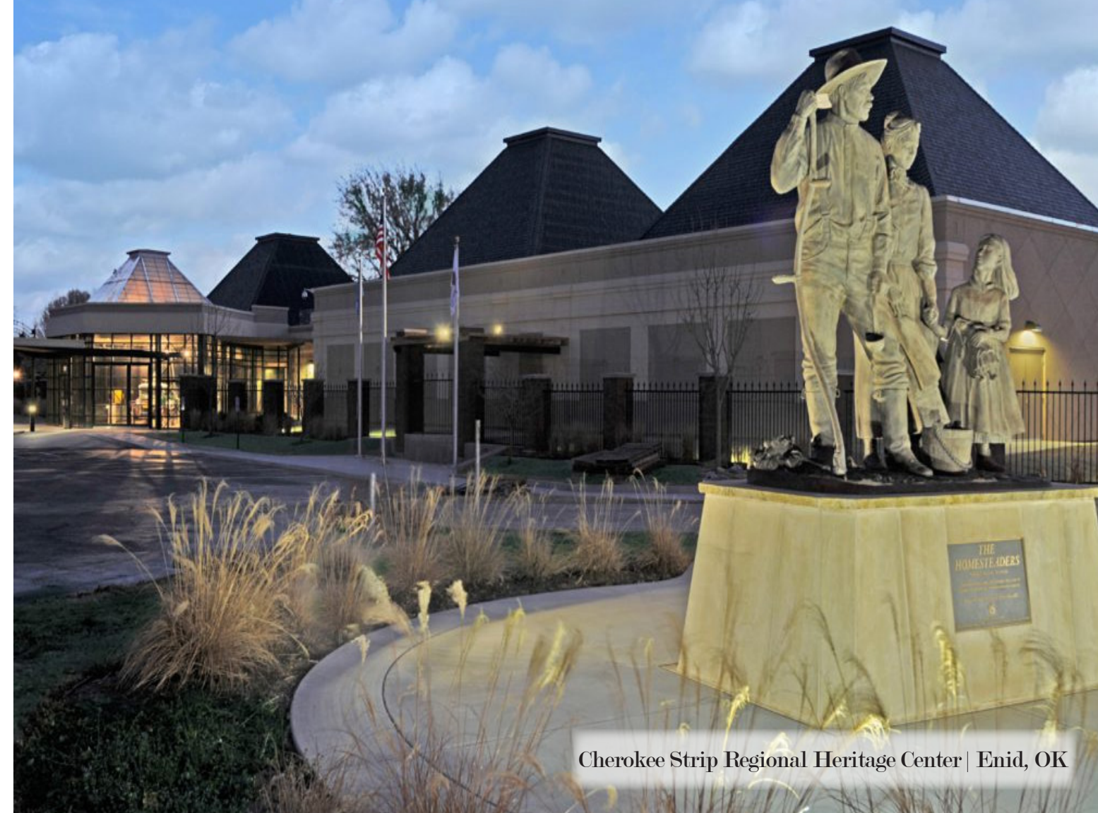
Cherokee Strip Regional Heritage Center | Enid, OK