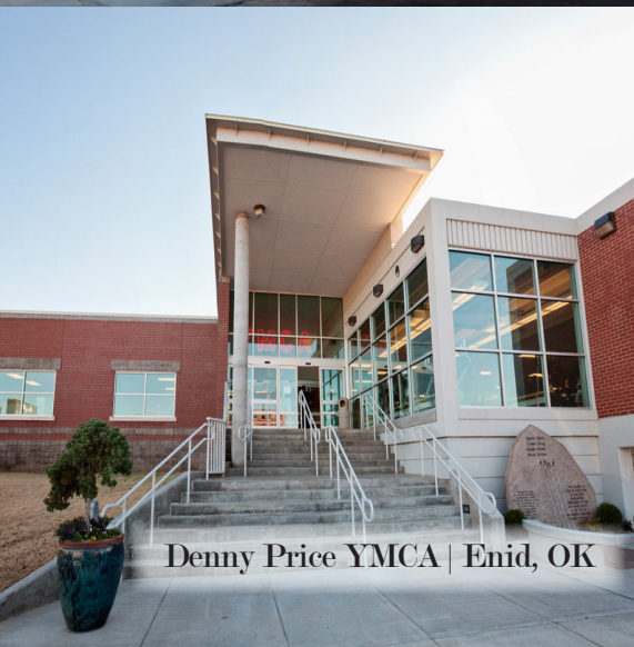
Denny Price YMCA | Enid, OK