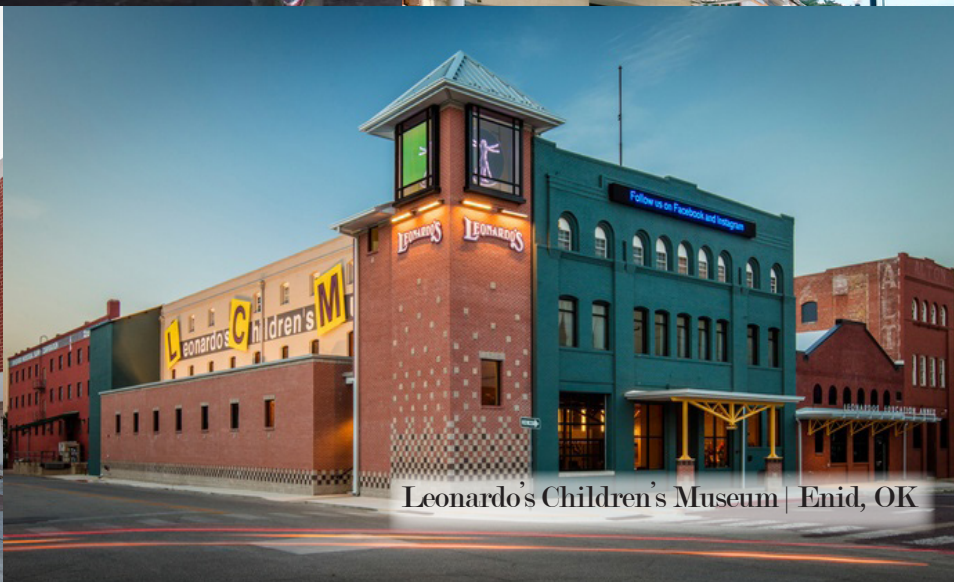
Leonardo's Children's Museum | Enid, OK