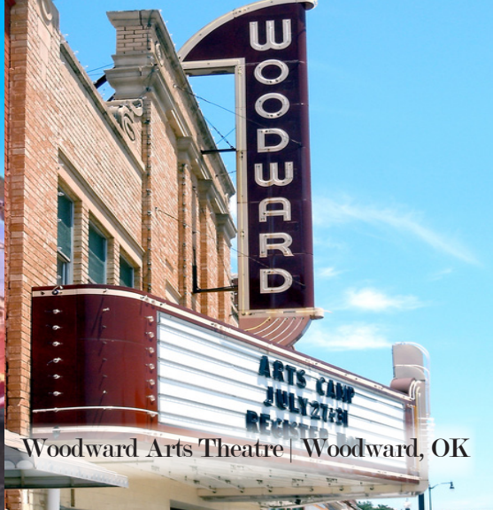
Woodward Arts Theatre | Woodward, OK