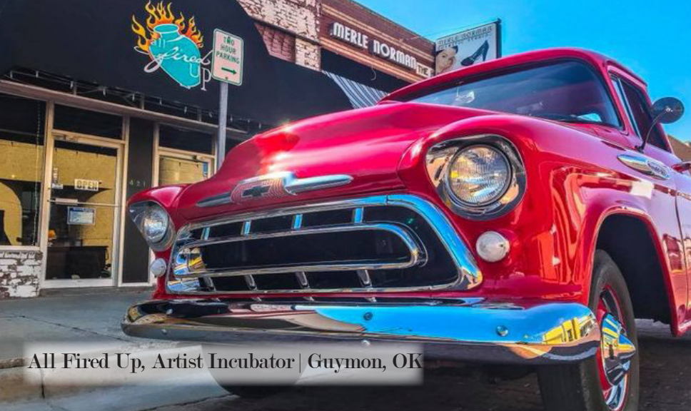
All Fired Up, Artist Incubator | Guymon, OK